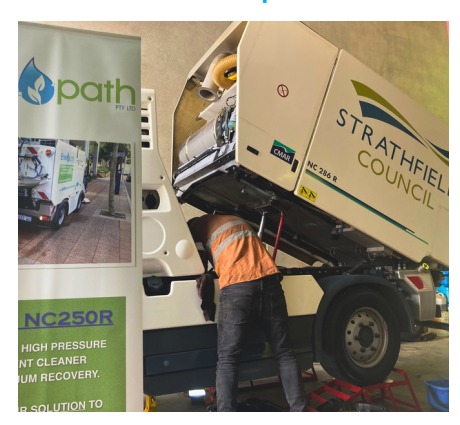
We provide the maintenance on all the machines we service and supply sparts parts for all our machines Australia wide