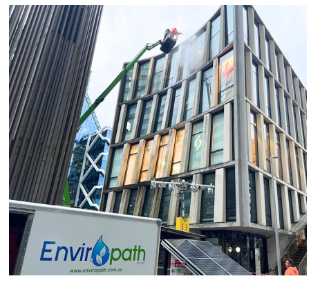
Revitalise your building façade with Enviropath. We get the job done safely & efficiently in a cost-effective manner