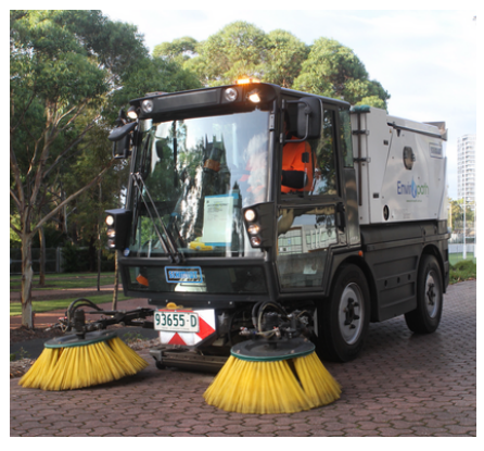
Enviropath can meet all your sweeping requirements including curb and channel sweeping, footpath sweeping, car park sweeping, leaf removal