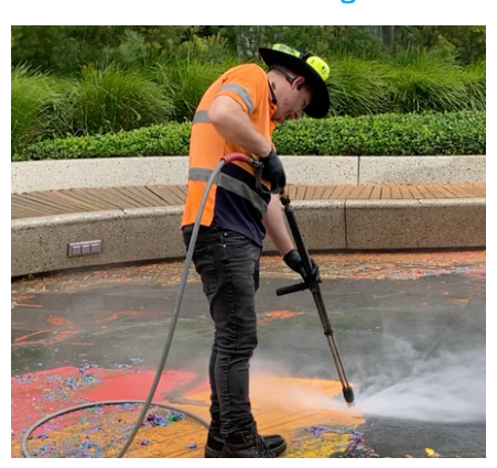
Remove any paint spills, stains and any graffiti with Enviropaths specialised equipment and methodology