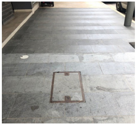
Bring your surfaces back to life with our pressure cleaning & sealing. Pictured is Brighton Le Sands before and after sealing