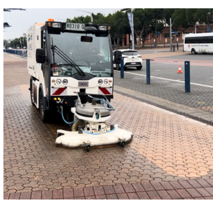
High pressure cleaning Sydney Olympic Park using the CMAR R 2500 hot water pressure cleaner.